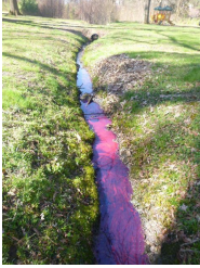
Figure 1- example of pollution flowing in a storm water swale

Illicit Discharge Detection and Elimination is a very important MCM. Figure 1 below illustrates a pollutant flowing in a stormwater drainage swale.