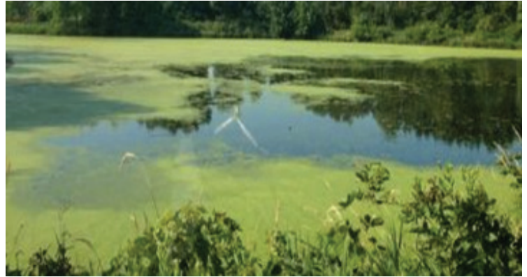
Figure 1 Algae-contaminated water

Animal waste contains two main types of pollutants that harm local waters: nutrients and pathogens. When this waste ends up in water bodies, it decomposes, releasing nutrients that cause excessive growth of algae and weeds. This reduces oxygen levels and makes the water murky, green (see Figure 1), smelly, and even unusable for swimming, boating, or fishing. The pathogens, disease-causing bacteria and viruses, can also make local waters unswimmable and unfishable, and have caused severe illness in humans.