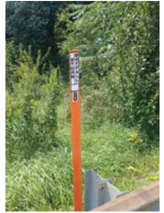
Marker Stormwater Outfall No.8

This year the Public Works Department stepped up outfall training for staff relative to location, type of outfall, and modified maps to include GPS geographic coordinates. Additionally, reference markers have been installed at all outfall locations. Please see photo example on the right.